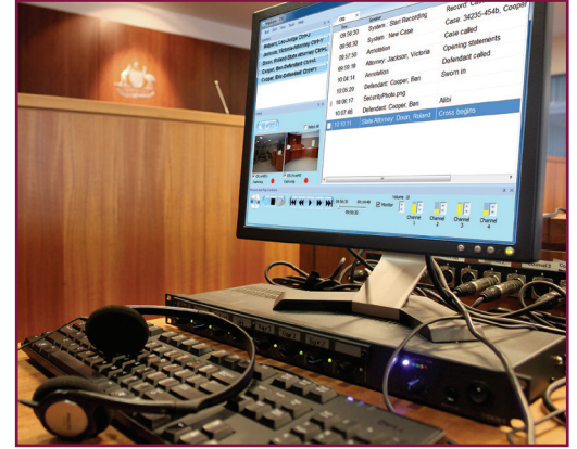
VIQ for Courts

VIQ is compatible with a wide range of video and audio capture hardware to give you the most flexibility. We provide the solution that's right for you, from a single camera and microphone to a country-wide installation of hundreds of courtrooms.